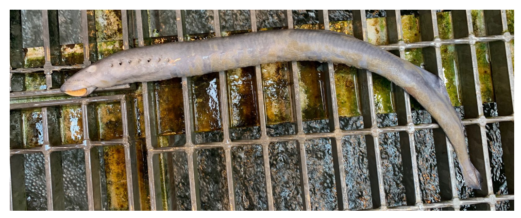
Sincerely, Project Fisheries